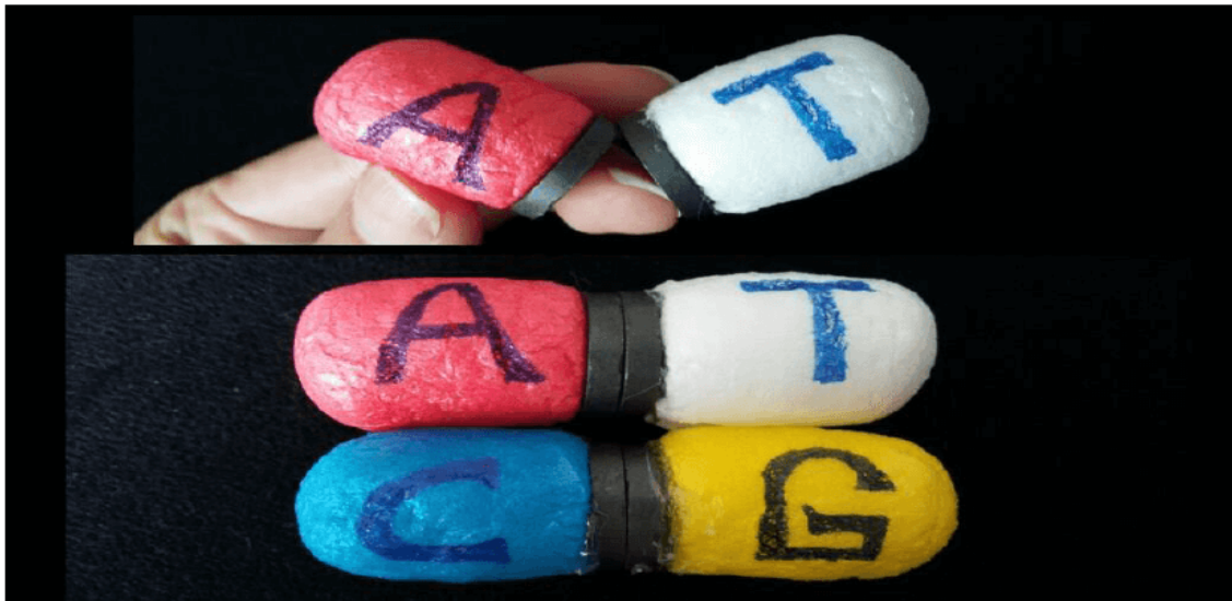
Photo 2. Visual example of the design process of a DNA model

STEM technique was used in the design and development of this material. STEM technique was used in the research by integrating it into the Integral ASIE model. Accordingly, magnetic bases were designed to represent the bases in the DNA helix (Photo 2). The opposite poles (N-S) of the magnets were arranged according to the bonding of the bases with each other.