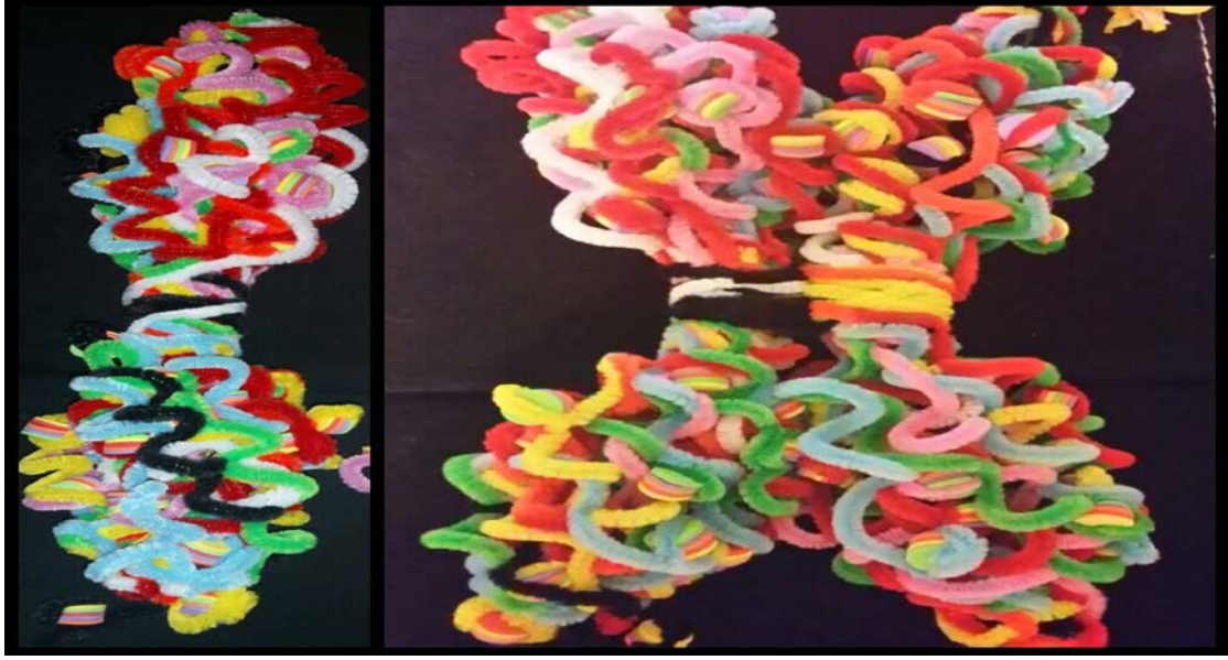
Photo 3. Visual example of the design process of a chromosome model