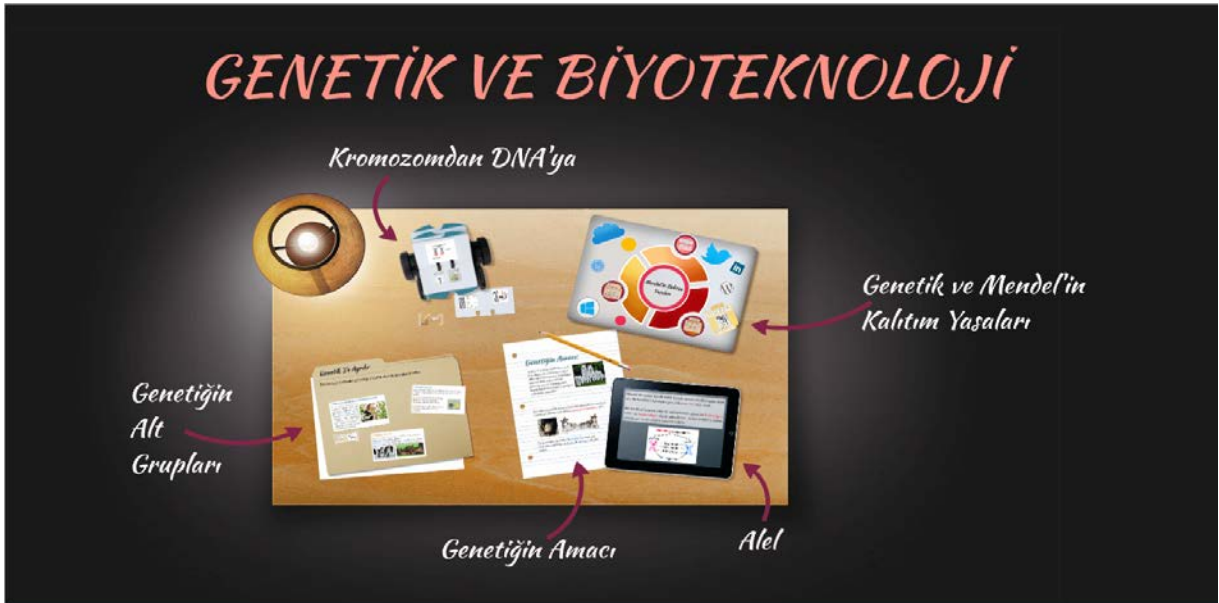
Photo 4. An example of a visual of the presentation prepared with Prezi presentation program

The lecture presentations developed in order to support genetic lecture notes were prepared using the Prezi presentation program (Photo 4). In this presentation program, slides are supported by zooming in and out, motion effects and spatial relationships can be established between slides. This enables the design of more visually striking presentations.