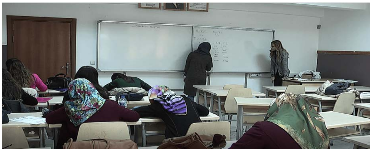
Photo 6. An example of a visual of the lectures taught to the control group

Before starting the lecture in the experimental group, the previously developed GAT was applied as a pre-test and the designed GLN was distributed to preservice teachers in the control group. The theoretical bases of the courses were carried out in line with these notes and parallel to the experimental group (Photo 6).