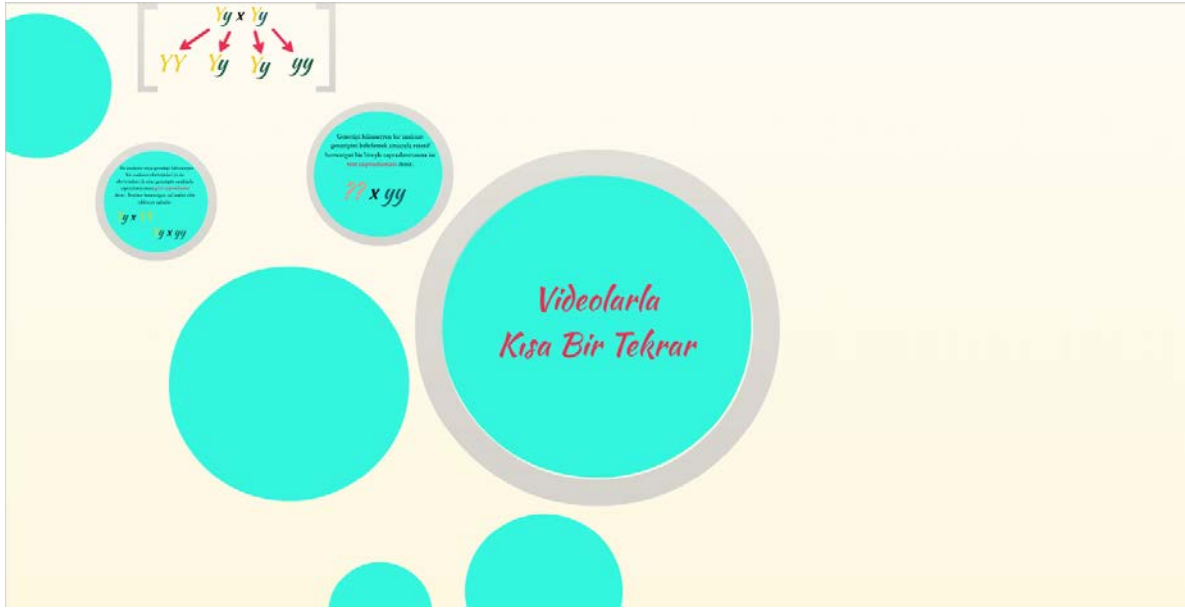
Photo 5. An example of a visual of the videos prepared with Prezi presentation program