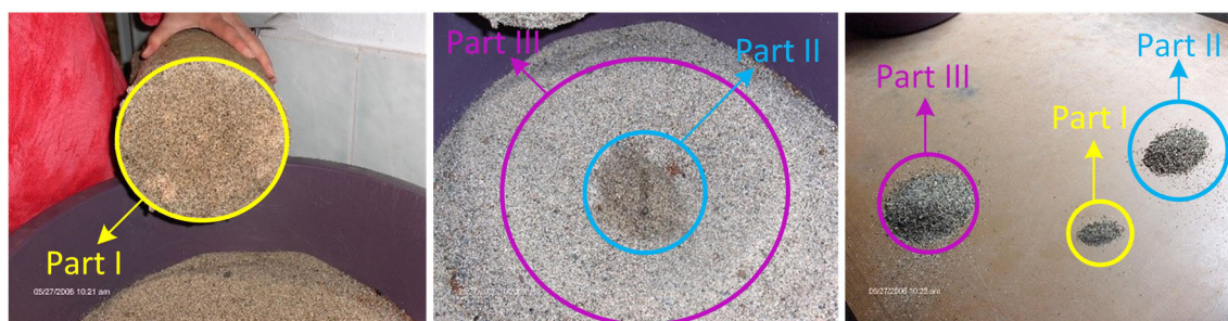
Fig. 2 Parts of sand where Rhizophagus grandis progenies are collected

Average breeding time ( \pm SD) was 66.4 ( \pm 6.4) days. At the end of breeding time, 76.3 % of the total progenies were adults, 5.1 % were young adults, 13.2 % were prepupa and 5.4 % were pupae. At the end of the experimental periods, 81.4 % of the progenies have become adults. Grégoire et al. (1989) stated that 72 % of the R. grandis individuals obtained at the end of 60–80 days were adults, 18 % were prepupa and 10 % were larvae during their breeding experiments performed in polyester boxes at room temperature in 1986. These results support the validity of our breeding method and the adult rates obtained from breeding experiment. It is stated that the generation time of the predator is 67 days on average when the rearing has been performed at an average temperature of 22 °C and 75 % humidity environment (Keskinalemdar et al. 1986; Alkan and Aksu 1990). At least 25 days at room temperature are needed for incubation of the eggs and larval development and plus 45 days for prepupas to develop into young adults (Merlin et al., 1984). Data from the larval, prepupa and adult stages of R. grandis and the timing of the life cycle indicate that this species has an excellent survival strategy. Furthermore, the predator's ability to survive for long periods and having flexible phenology enables consume most development stages of its prey that can be found at any time of the year. The observed delay in prepupal