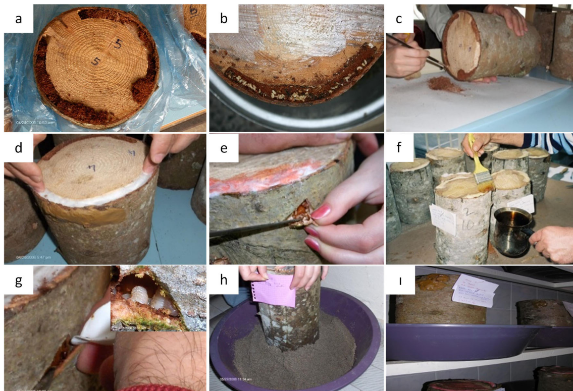
Fig. 1 a Setup of the rearing experiment (a) introducing wild D. micans larvae into the engraved parts, (b) engraved parts on the opposite sides of the breeding log and larval frass produced by introduced D. micans larvae, (c) cleaning larval frass, (d) closure of the engraved parts where

periods include a period of time that start from introduction date of D. micans larvae to breeding logs until collection of new progenies of R. grandis from sand environment. Breeding time that were determined depending on preliminary experiments and former works include a period of time that start from introduction date of R. grandis pairs into breeding logs until the collection of new progenies from sand environment.